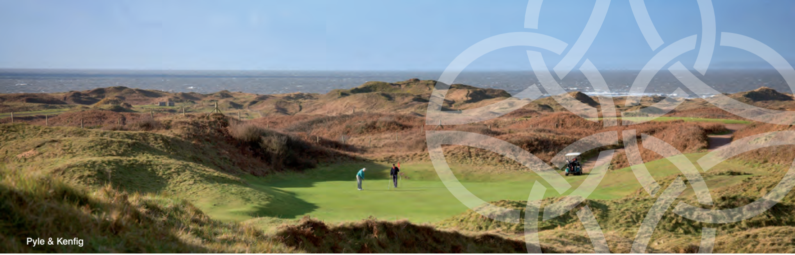
Pyle & Kenfig